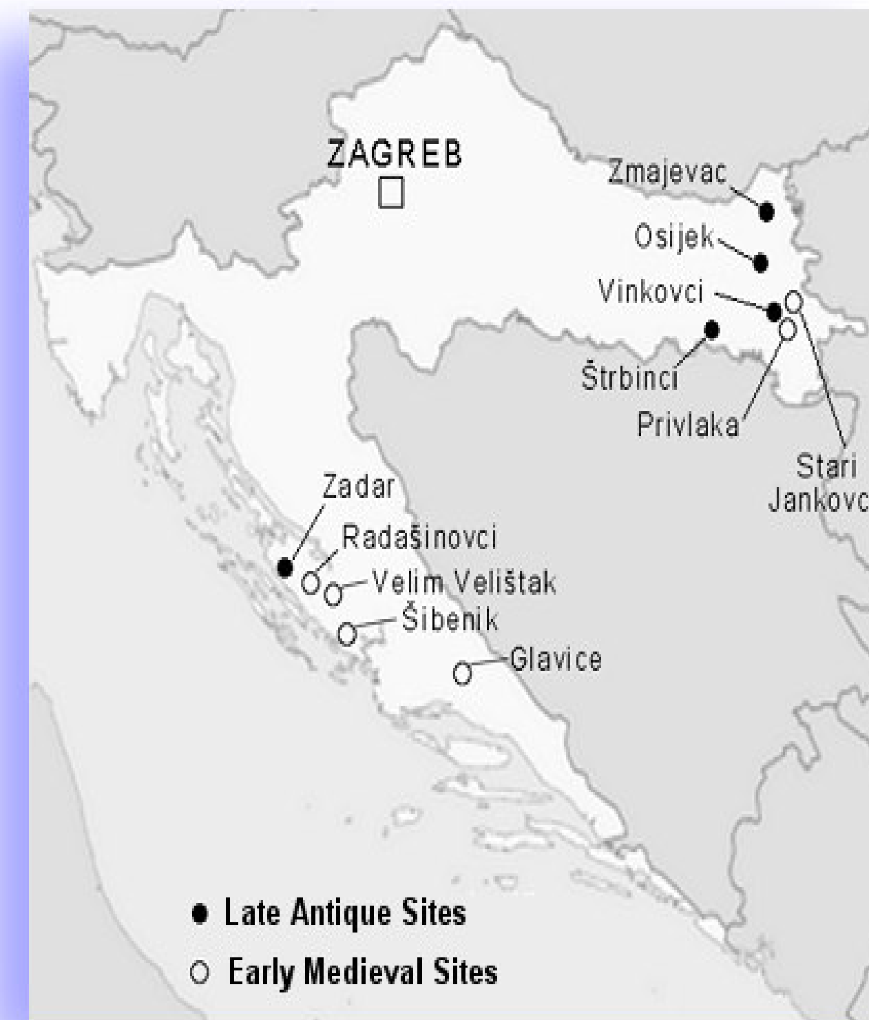
Map of Croatia with the geographical positions of the analyzed sites

The osteological material analyzed in this study was divided into two composite skeletal series originated from 11 sites located in continental Croatia, and along the eastern Adriatic coast. The LA series consists of 193 skeletons and the EM series of 321 skeletons. Periapical lesions were diagnosed macroscopically; their frequency, size and localization was registered.